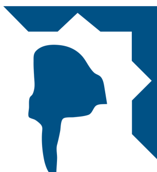
Abasabad Renovation Company

In the end, while explaining the latest status and facilities of Abas Abad Eco Park, as an affiliated member of the World Tourism Organization (UNWTO), he announced the readiness of this complex to exchange experiences in various civil, technical, educational issues and economic and investment partnerships. Meeting and talking with the Deputy Minister of Infrastructure of Russia, the Deputy Mayor of Moscow, the head of the Russian Tour Operators Union, the head of the Russian International Academy for Tourism (RIAT), the head of the Board of Directors of the Association of Parks of Russia, etc. were among the other plans of this trip.